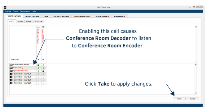
FIG. 2 CREATING STREAMING COMBINATIONS