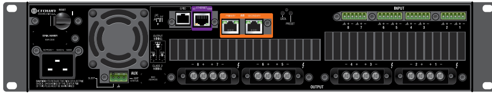
8 channel model